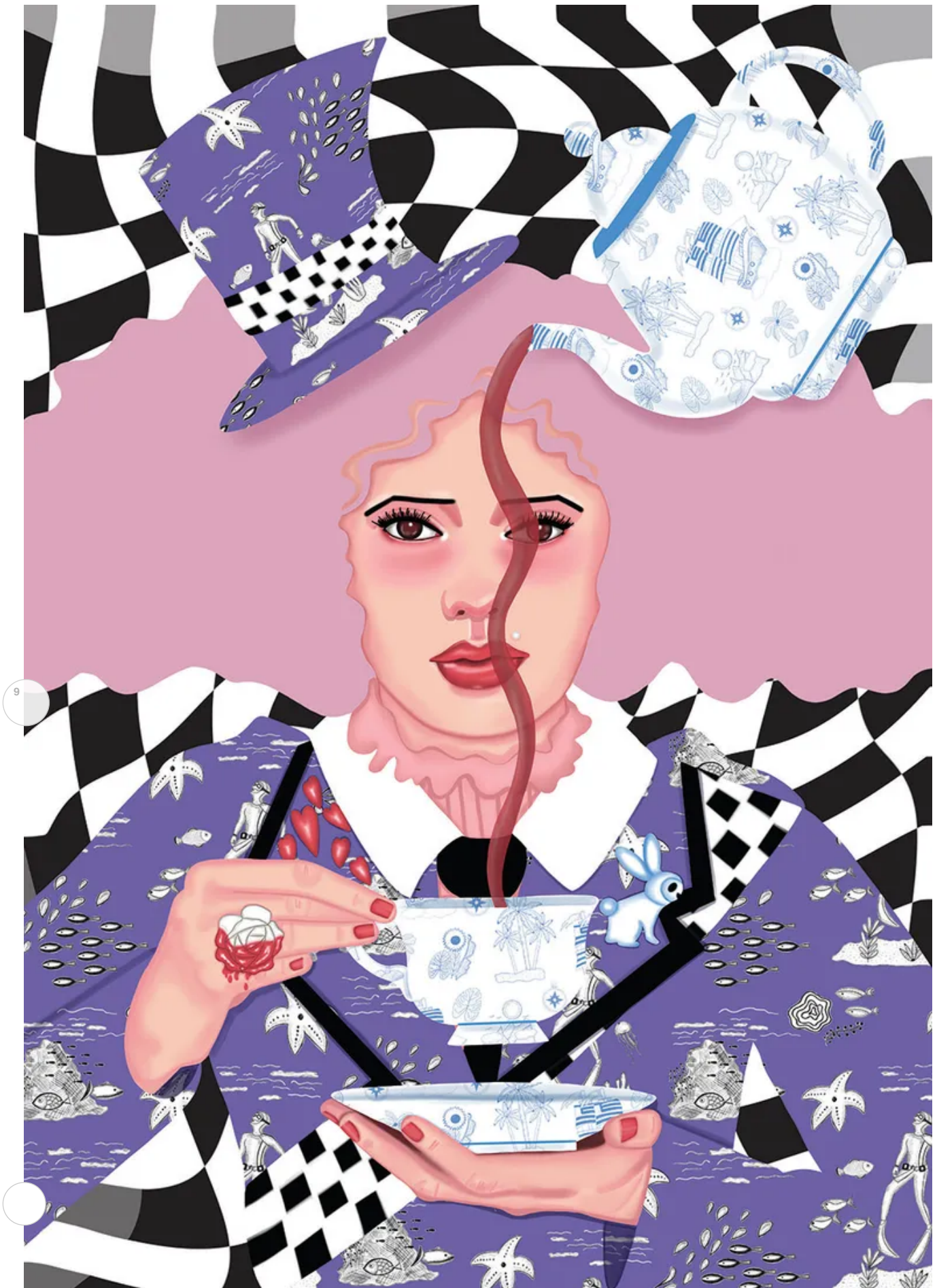
Tea Time - inspired by ATEEZ Wonderland and Alice

What are the things you would like ATINY to notice in your book?